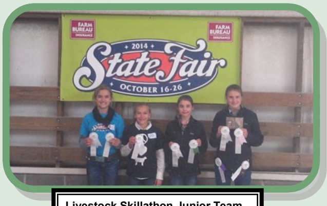
Livestock Skillathon Junior Team