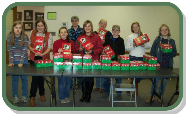
Alamance County 4-Hers donated items and assembled shoeboxes for Operation Christmas Child!