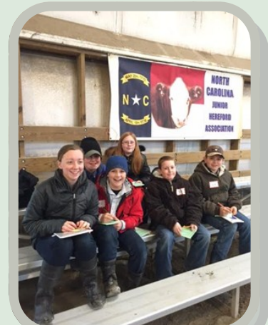
Judging in January participants