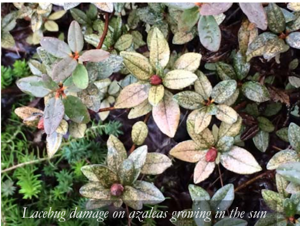
Lacebug damage on azaleas growing in the sun

Many plants have a preference as to how many hours of sunlight or shade they will tolerate. Too much or too little sun can lead to poor plant growth and increased susceptibility to insect and disease problems. Azaleas grown in full sun will usually have problems with lace bugs, but azaleas grown in part shade will rarely have lace bug problems.