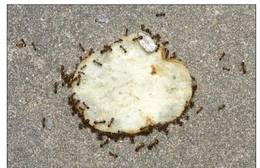
Use potato chips to check for fire ant foraging activity. They will find the chips within 30 minutes if they are actively foraging.

If you have any questions about fire ants or any other gardening topic, please give me or Chris a call.